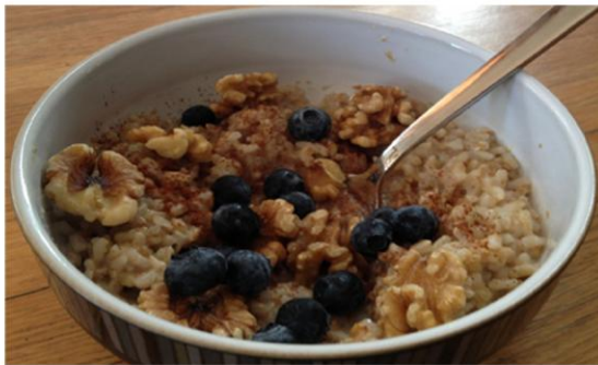
Sweet Milk Rice