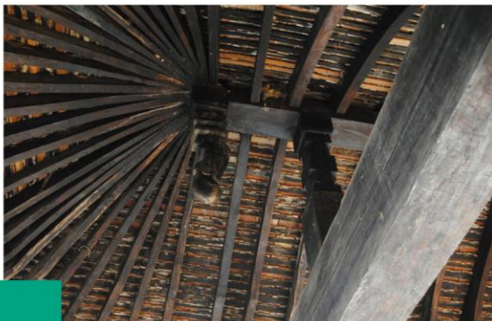
"Madol Kurupawa", pins 26 beams together.