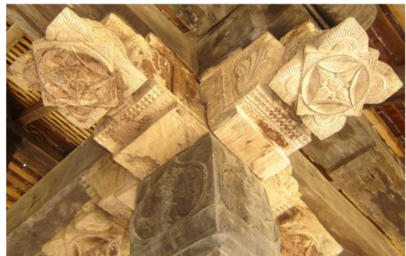
Pillar top has a similar carving across the "Drummers' Hall".