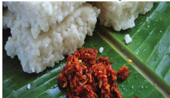
Hot Milk Rice