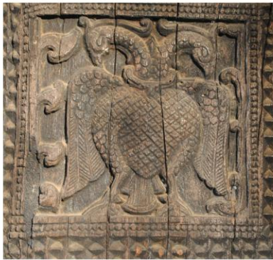
Double headed Eagle